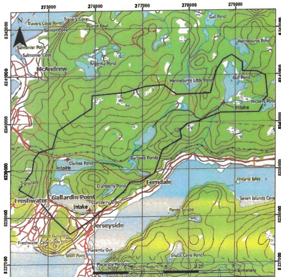
Larkins Pond Protected Water Supply Area WS-S-0549

As of the date this Notice is printed in the Newfoundland and Labrador Gazette , it is an offence to undertake any development or activity in this area without prior written authorization from the Minister of Environment and Climate Change.